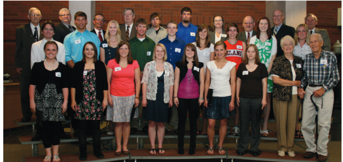
Twenty-one local students received scholarships from WH Holding Company in 2011, totaling $28,700 (this company serves as the holding structure for Wright-Hennepin's non-electric subsidiary businesses).