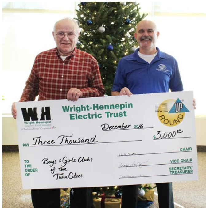
Operation Round Up recently awarded a grant to Boys & Girls Clubs of the Twin Cities in the amount of $3,000 to support “Voyager,” an environmental camp located in