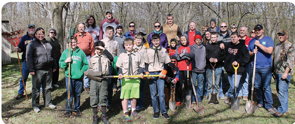
Approximately 35 volunteers joined Wright-Hennepin and rangers from Lake Maria State Park for the annual spring cleanup day at the Monticello park. They planted 500 tree seedlings, cleaned common areas, raked leaves and much more on Saturday, April 29.

The event marks the 17th straight year WH has co-sponsored the cleanup with Lake Maria State Park.