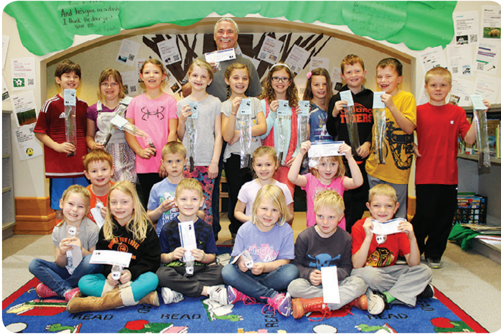
Third graders and kindergarteners from Delano Elementary proudly display their trees and LED night lights donated by Wright-Hennepin just before Earth Day.

Tree seedling types included: red maple, bur oak, pin oak, blue spruce and Norway spruce. WH also reserves some of the seedlings for planting during its annual cleanup day at Lake Maria State Park with help from local Boy and Girl Scouts.