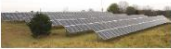
Wright-Hennepin Cooperative Electric Association's Project 4 – Solar Array, Medina Minn.