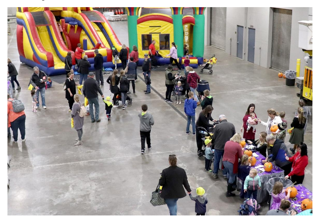
More than 210 people came to WH's Fall Festival on October 24 and enjoyed activities including pumpkin decorating, face painting, bounce houses and line trucks.