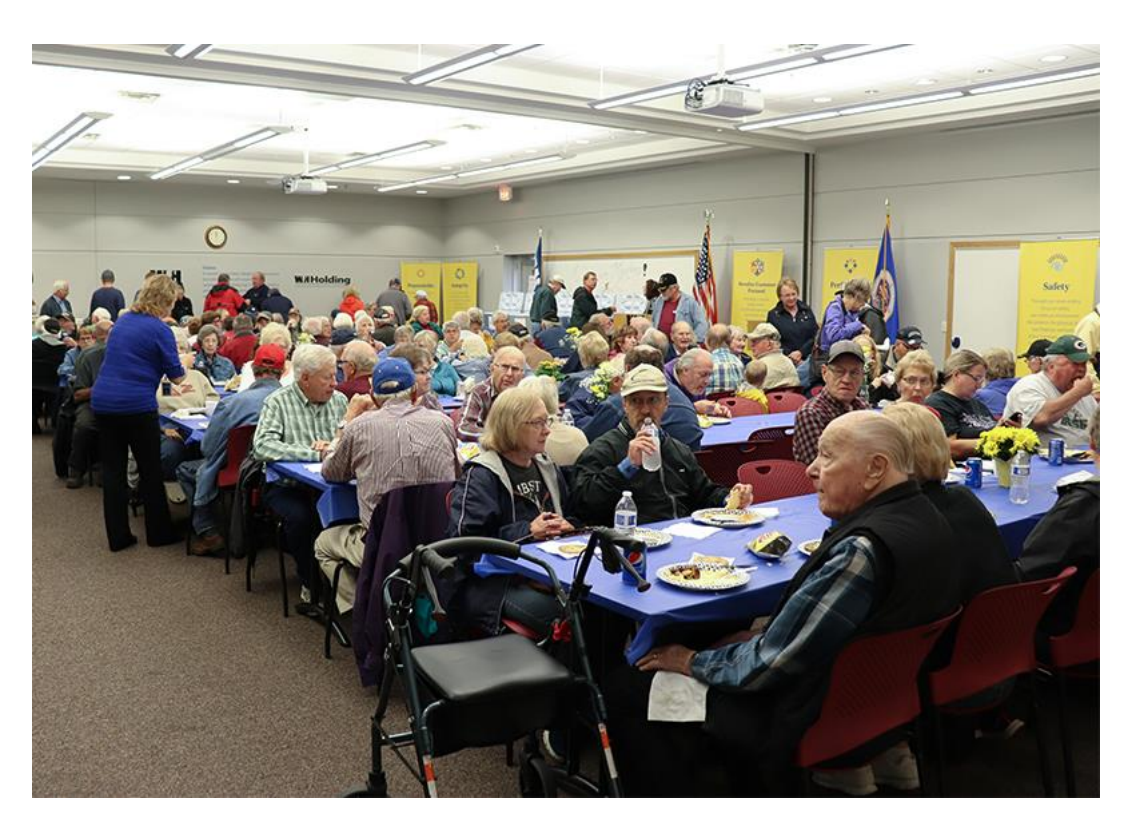
More than 200 members came to WH's Member Appreciation Lunch on October 10 to enjoy a delicious meal and great conversation.