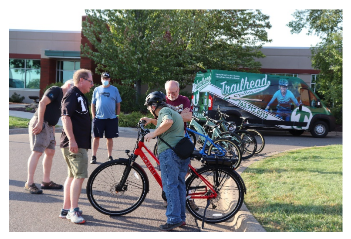
Members look on as they learn about options for electric bikes. Trailhead Cycling provided seven bikes for members to test ride.