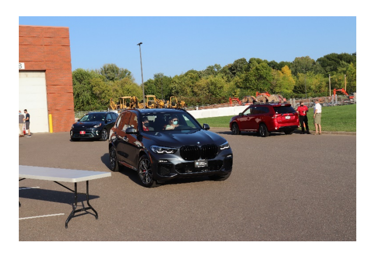
A member takes a test ride in a BMW X5. There were seven vehicles available for test drives.