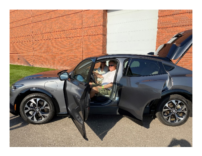
Two members check out a Ford Mustang Mach-E. More than 20 vehicles were on display for members to learn about.