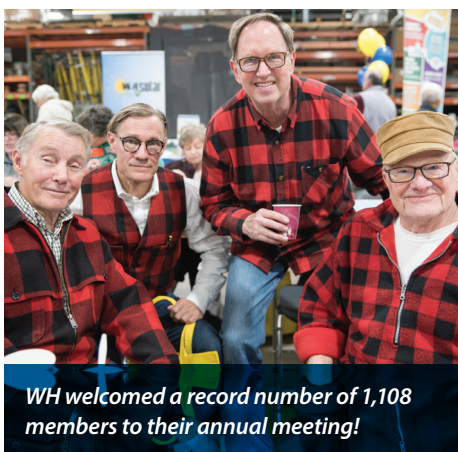
WH welcomed a record number of 1,108 members to their annual meeting!

Wright-Hennepin (WH) broke records at its 82nd Annual Meeting on Thursday, May 2. Built around the theme "Keeping costs down together," more than 2,500 people convened at WH's headquarters in Rockford to enjoy various activities.