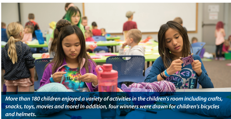
More than 180 children enjoyed a variety of activities in the children's room including crafts, snacks, toys, movies and more! In addition, four winners were drawn for children's bicycles and helmets.