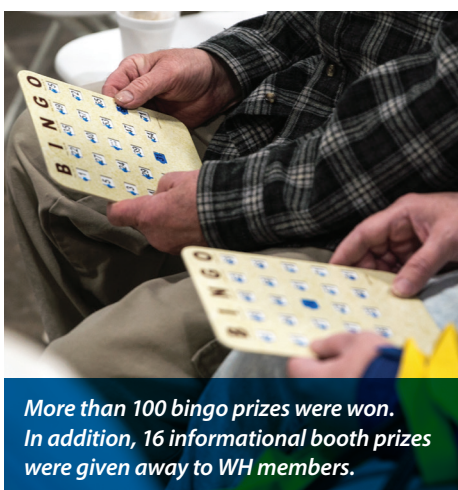
More than 100 bingo prizes were won. In addition, 16 informational booth prizes were given away to WH members.