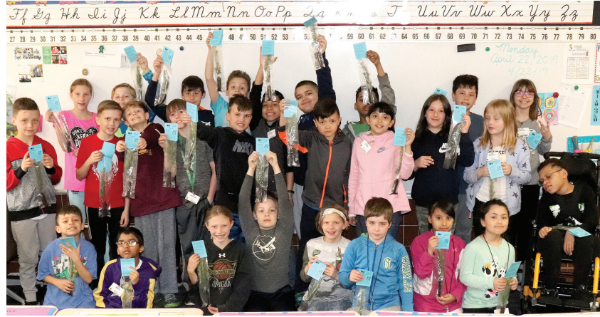
Kindergartners (left) and third graders (right) from Cedar Island Elementary School in Maple Grove proudly display their LED night lights and tree seedlings donated by WH.