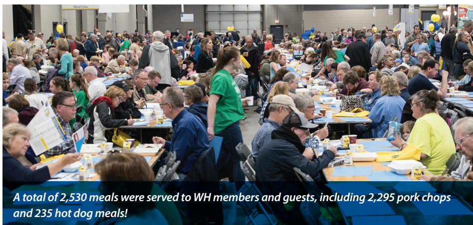
A total of 2,530 meals were served to WH members and guests, including 2,295 pork chops and 235 hot dog meals!