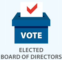
ELECTED BOARD OF DIRECTORS

IOUs have a Board of Directors chosen by shareholders to maximize profits.