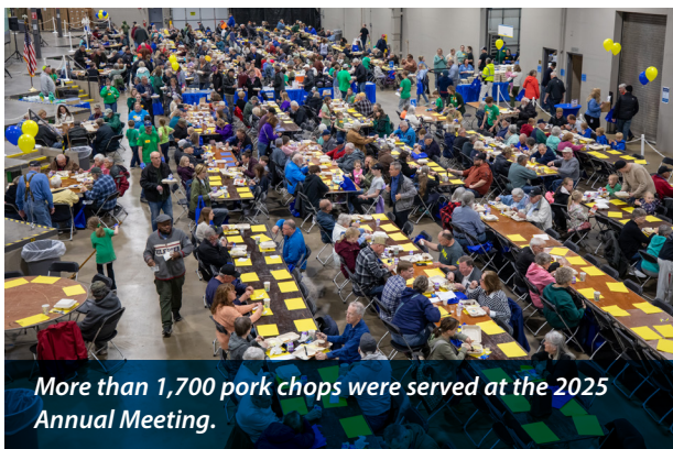
More than 1,700 pork chops were served at the 2025 Annual Meeting.