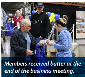
Members received butter at the end of the business meeting.