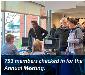
753 members checked in for the Annual Meeting.