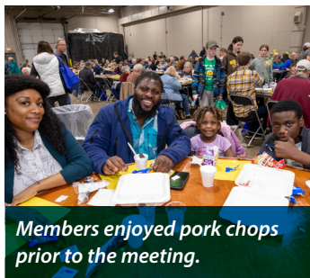
Members enjoyed pork chops prior to the meeting.