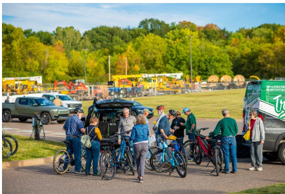
EV Ride & Drive Event attendees check out the electric bikes available for test rides.