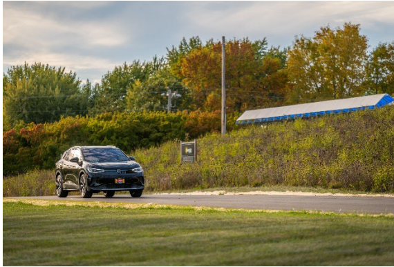
A WH member test drives one of the electric vehicles available during the EV Ride & Drive Event.